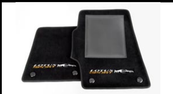
Lotus Sport Footwell Mat Set Part No. - LSPAC00058 (111R) all models available Application - S2 (Toyota) Elise/Exige High quality Lotus Sport branded footwell mat set with fixing points to replace factory fit mats. As fitted to all Lotus Sport factory vehicles.