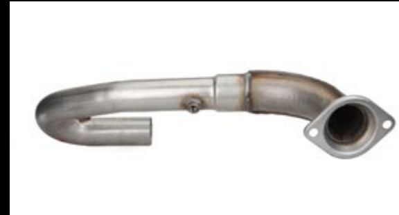
Lotus Sport Cup 255 De-Cat Pipe* Part No. - ALS3S0014S Applications - S2 (Toyota) Exige Lotus Sport developed part for the Cup 255 vehicle for track use only. Replaces the catalytic converter with a straight through exhaust section. Also reduces overall mass of the exhaust system. Strictly for track use only.