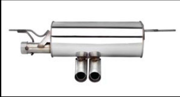
Lotus Stage 1 Silencer* Part No. - LOTAC05334 Applications - S2 (Toyota) Elise/Exige Stage 1 stainless steel silencer for a sporty exhaust note. Lotus Aftersales part - see brochure