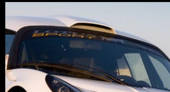
Lotus Sport Windscreen Decal Part No. - ALS3V0021F Applications - All Lotus Sport vehicles (with windscreens!) Lotus sport sunvisor strip decal in silver and black to compliment your Lotus Sport developed vehicle.