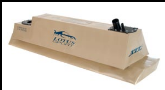
70L ATL 'Bag Tank' Fuel Cell FT3 FIA Approved* Part No. - ALS3L6009F Applications - S2 (Toyota) Elise/Exige/2-Eleven 70L FIA compliant fuel cell. Foam filled anti surge tank. Retains existing Lotus fuel pump. Service life applies.