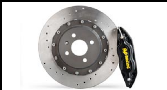
Big Brake Four Pot Upgrade Kit Part no. - ELS3J0040F Applications - S2 (Toyota) Elise/Exige/2-Eleven Designed for competition, this AP Racing big brake kit will dramatically enhance your braking performance and improve cooling. Bedding in procedures apply.