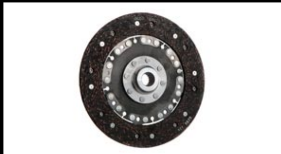
COMING SOON Lotus Sport AP Clutch for Dog Gearbox* 1 Part No. - ALS3Q6016F Applications - S2 (Toyota) Exige when fitted with Dog box AP Racing clutch plate (CP - 5341 - 13) developed for use with the dog box, utilising solid centre plate and improved material.