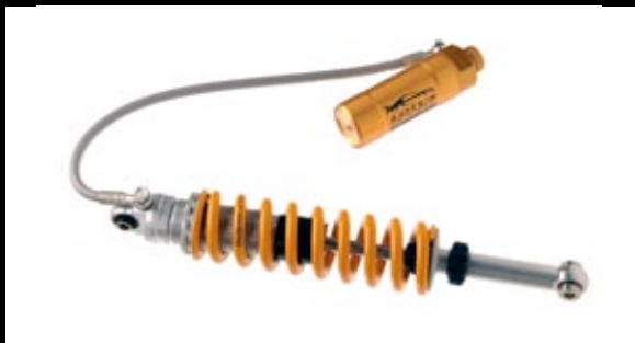
2 Way Adjustable Ohlins Damper and Spring - Car Kit Part No. - CLS3C6001J/2J, CLS3CD6001J/2J Applications - S2 (Toyota) Elise/Exige These performance Dampers, developed by Lotus ride and handling specially for Elise/Exige models. The units are adjustable for low speed bump and rebound, offering the ability to fine tune vehicle handling for the perfect set up.