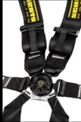
6 Point FIA Safety Harness* Part No. - ALS1V0015F Applications - Elise/Exige/2-Eleven fitted with roll cage with harness mount bar Six point FIA approved seat harness. Only to be used with an MSA/FIA approved race seat and harness mount bar.