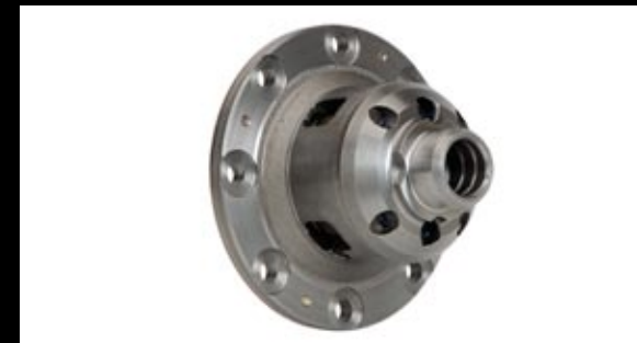
Lotus Sport Plate Type Limited Slip Differential* Part No. - ALS3F6000F Applications - S2 (Toyota) Elise/Exige/2-Eleven ZF plate type differential developed by Lotus Sport. This offers ultimate traction levels through cornering, whilst giving a predictable and stable handling car. Special service conditions apply.