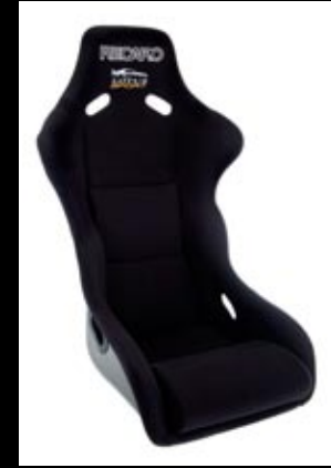
FIA Approved Lotus Sport Recaro Seat kit with seat runners* Part No. - ALS3V6043F Applications - Elise/Exige/2-Eleven This high specification Lotus Sport embroidered Recaro competition seat. Supplied with fitting kit and seat runners ready to fit.