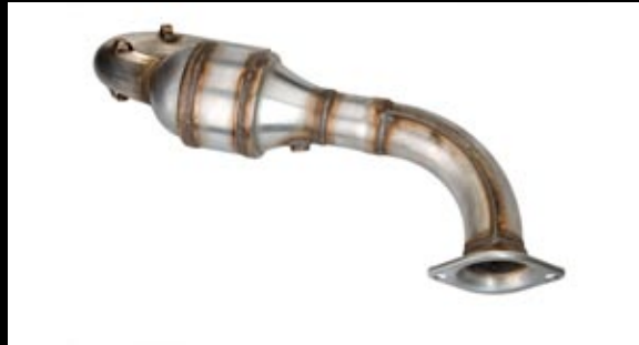
240R Catalyst Pipe* Part No. - ALS350001F Application - Exige 240R Catalyst pipe developed for the Exige 240R, direct replacement part.