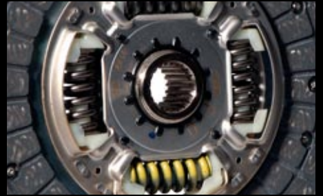
Engine & Drivetrain