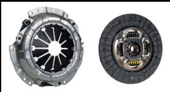
Updated Clutch Cover and Plate Part No. - ALS3Q6000F + ALS3Q6001F Applications - S2 (Toyota) Elise/Exige/2-Eleven This TRD competition clutch plate and cover is ideal for road and track use.