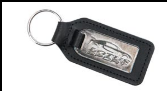
Lotus Sport Key Ring Part No. - MOTSP00157 Applications - All vehicles Leather key fob Lotus Sport branding.