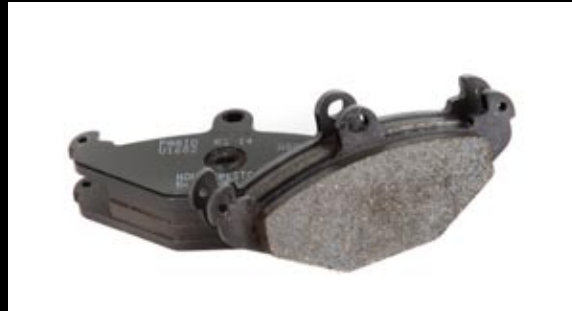
Performance Rear Brake Pads - Pagid RS14 Part No. - A111J0151S Applications - All S2 (Toyota) Elise/Exige/2-Eleven Pagid track brake pads with improved frictional coefficients for improved bite. Compound also improves fade resistance and whilst maintaining good wear rate characteristics.