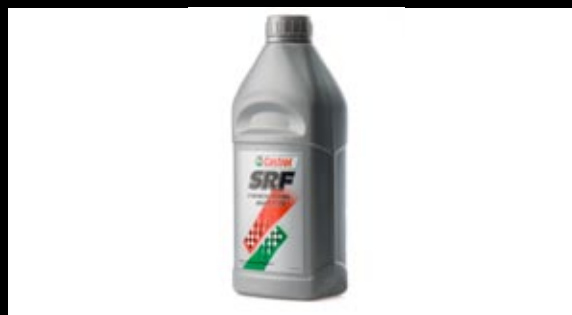
Castrol SRF Track Brake Fluid* Part No. - A34056001S Application - All vehicles High quality competition brake fluid with 600°C boiling point, for serious track use. Please call for a range of other Castrol brake fluids.