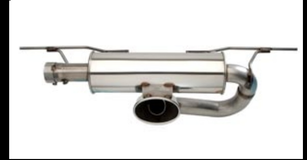
Lotus Stage 3 Silencer* Part No. - LOTAC05450 Applications - S2 (Toyota) S/C Exige Stage 3 stainless steel silencer for a loud exhaust note developed specifically for supercharged cars. Lotus Aftersales part - see brochure