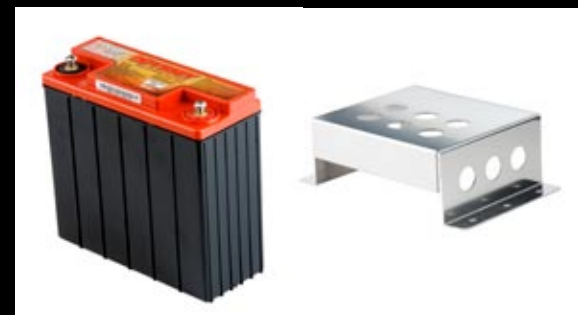
Lotus Sport Cup 255 Race Battery* Part No. - ALS3M0241F Part No. - ALS3M0260F Applications - All Lotus vehicles This motorsport specific battery is exceptionally small and lightweight. Uses absorbed glass mat and valve regulated lead acid technology. Excellent for deep cycle and cranking power.