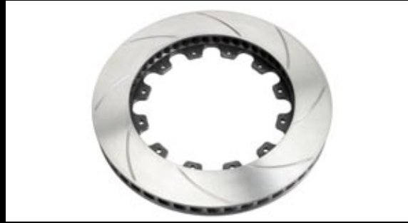
Big Brake Kit Grooved Discs* Part No. - ALS3J0100F (RH), ALS3J0101F (LH) Applications - S2 (Toyota) Vehicles fitted with Big Brake kit These grooved brake discs offer an alternative to the cross drilled brake discs supplied with the Big Brake kit as standard. Bedding in procedures apply.