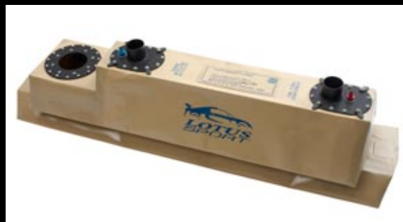
70L ATL 'Bag Tank' Fuel Cell FT3 FIA Approved* - Dry Break Part No. ALS3L0046F Applications - S2 (Toyota) Exige 70L FIA compliant fuel cell with external dry break type filler necks. Foam filled anti surge tank retaining existing fuel pumps. Requires bodywork modifications to fit fuel necks. Service life applies.