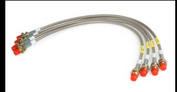
Lotus Sport Goodridge Brake Hose Set Part No. - BLS3J0047F Application - S2 (Toyota) Elise/Exige/2-Eleven Goodridge stainless steel braided hose set to improve pedal feel and longevity. Recommended for track use.