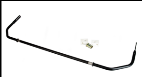
Lotus Sport Front Anti Roll Bar Part No. - A111C0134S Application - S2 (Toyota) Elise/Exige Lotus sport developed front anti roll bar with a range of adjustability for fine handling control, for track and fast road use. Recommended to be used in conjunction with Ohlins dampers and Lotus sport wheel package.