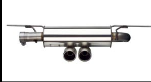
Lotus Stage 2 Silencer* Part No. - LOTAC05335 Applications - S2 (Toyota) N/A Elise/Exige Stage 2 Stainless steel silencer for a loud and very sporty exhaust note for naturally aspirated cars only. Lotus Aftersales part - see brochure