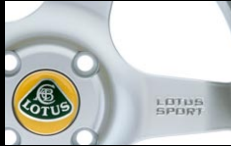
Wheels & Tyres