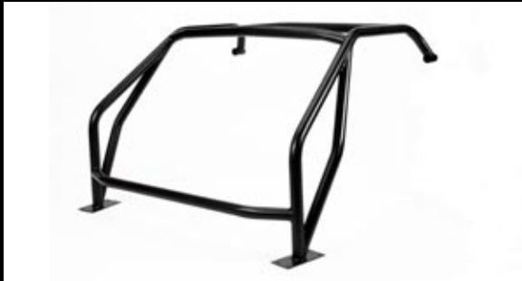
FIA Roll Cage Assembly* Part No. - ALS3V0022J (RHD), ALS3V0023J (LHD) Applications - S2 (Toyota) Exige Full FIA specification T45 Roll Cage. Includes front cage and A frame. Includes fitting kit. Can only be fitted to cars with T45 roll over bar fitted (A122A0046F).