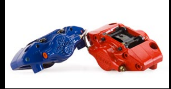
Lotus Colour Coded Brake Callipers. Part No. - Blue LF: ALS2J0005F Red LF: ALS2J0001F RF: ALS2J0006F RF: ALS2J0002F LR: ALS2J0007F LR: ALS2J0003F RR: ALS2J0008F RR: ALS2J0004F Application - S2 (Toyota) Elise/Exige/2-Eleven Also available in silver and yellow.