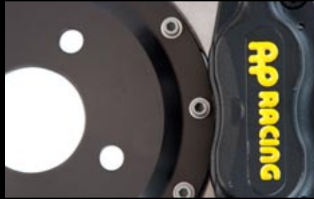
Suspension & Brakes