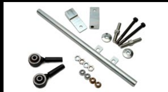
Lotus Rear Toe Link Brace Kit Part No. - LOTAC05377 Applications - S2 (Toyota) Elise/Exige Chassis brace kit to improve stiffness of lower track control arm and place lower ball joints in double shear. Recommended for track use.