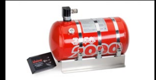
Life Line Electronic Fire Extinguisher Kit* Part No. - ALS3V0038J Applications - All vehicles (please call for information) Fire extinguisher kit, electrically operated four nozzle system.