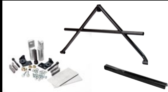
Roll Cage Fitting Kit and rear A frame included in assembly, padding additional