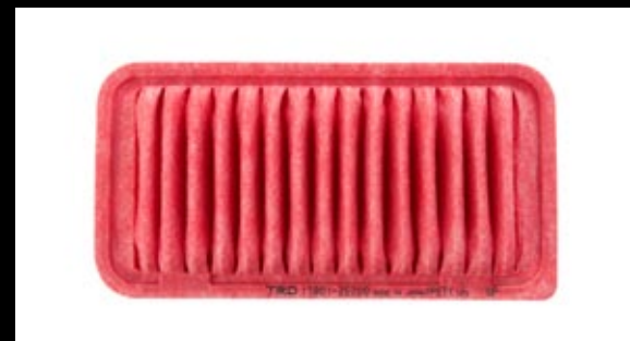
TRD Performance Air Filter Part No. - ALS3E6020F Applications - S2 (Toyota) NA Elise/Exige TRD performance air filter for use with naturally aspirated Toyota 2ZZ - GE engine cars. Improves engine response.