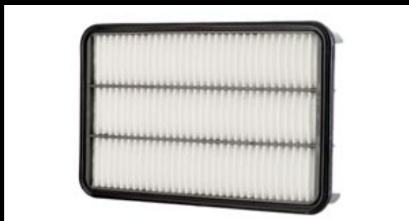
Lotus High Flow Air Filter* Part No. - ALS3E0158F Application - All S2 (Toyota) SC Exige High flow Toyota developed air filter for supercharged cars. Improves engine response and recommended for track use.