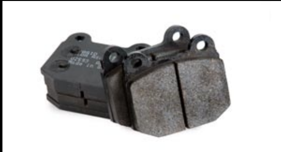
Performance Front Brake Pads - Pagid RS14 Part No. - A111J0150S Applications - All S2 (Toyota) Elise/Exige/2-Eleven Pagid track brake pads with improved frictional coefficients for improved bite. Compound also improves fade resistance and whilst maintaining good wear rate characteristics.