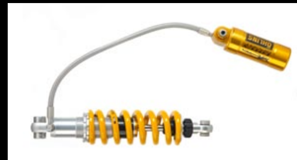
Lotus Sport 3 Way Adjustable Ohlins Dampers* 1 Part No. - Front ALS3C0105J/06J FIA GT4 Rear ALS3D0107J/08J FIA GT4 Front ALS3C0108J/09J 2-Eleven Rear ALS3D0110J/11J 2-Eleven Applications - S2 (Toyota) Exige/2-Eleven High specification 3 way adjustable dampers developed for race cars with slick tyres. The units are adjustable for high/low speed bump and rebound.