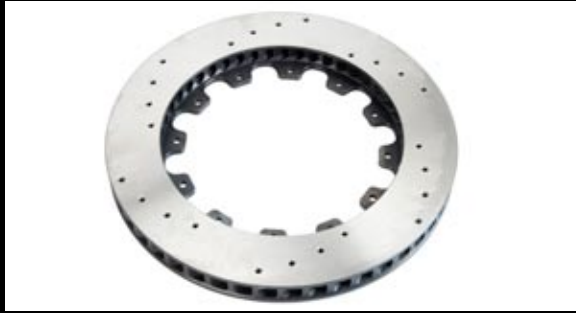
Big Brake Kit Drilled Discs Part No. - ALS3J0164F (RH), ALS3J0165F (LH) Applications - S2 (Toyota) Vehicles fitted with Big Brake kit These cross drilled brake discs are standard fitment with the Big Brake Kit. Bedding in procedures apply.