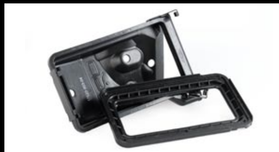
TRD High Flow Air Filter Air Box* Part No. - ALS3E0157F Application - S2 (Toyota) SC Exige TRD airbox designed to fit in conjunction with high flow air filter, improved flow characteristics for released engine response.