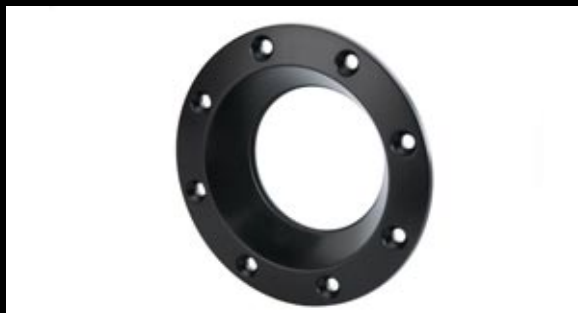
Black Filler Neck Surround Part No. - LSPAC00048 Applications - S2 Elise/Exige Black anodised aluminium fuel filler neck surround to match black filler cap.