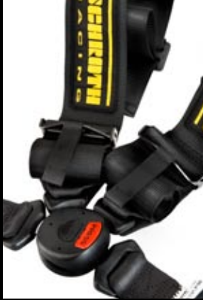
Lotus Sport 4 Point Safety Harness* Part No. - A122V0050F (RH), A122V0049F (LH) Applications - Elise/Exige/2-Eleven Lotus Sport 4 point competition harness as fitted to the current Lotus 2-Eleven vehicles with aircraft style buckle and lightweight adjuster buckles. Only to be used with sport seats and cars without airbags.