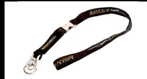
Lotus Sport Lanyard Part No. - LOTLS05046 Applications - All necks Lotus sport lanyard to keep your phone or keys handy.