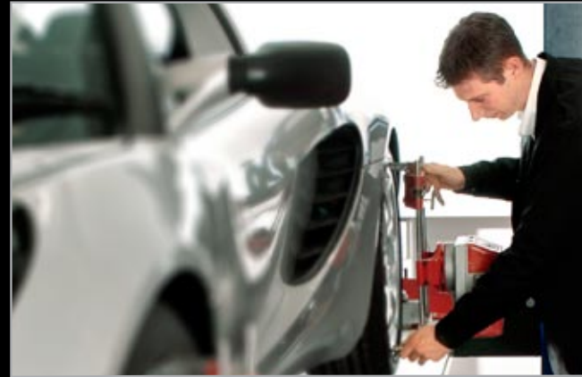
Workshop, Upgrades & Restorations